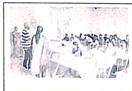
View of IV Year students & III Year students listening to Alumnus

No.: of students attended the session : 81